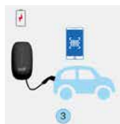
3 Scan the QR code to start charging.