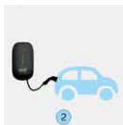
2 Connect the charging cable to the vehicle.