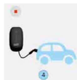
4 Stop charging from the App.