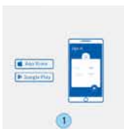
1 Download the App and register.