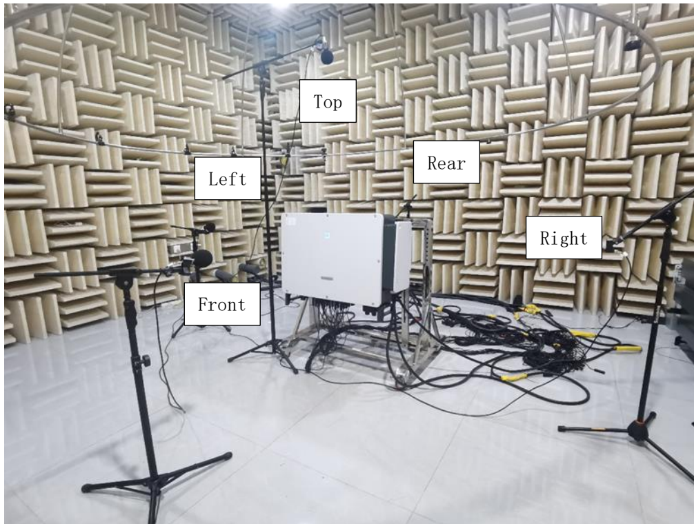
Fig. 1 Sensor Location in the Test