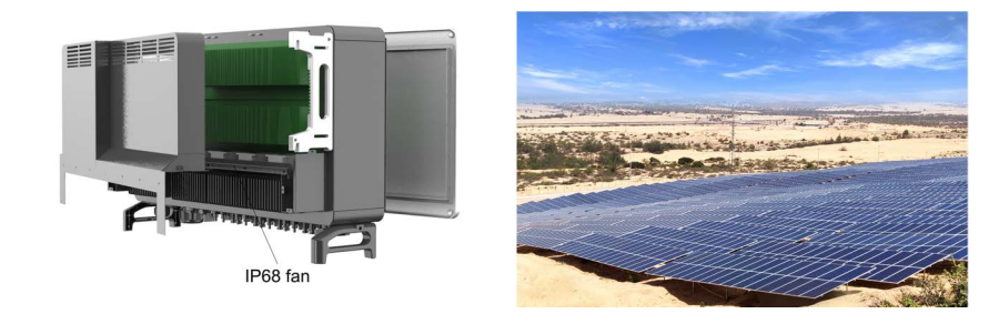
Fig.5 High Protection Rating and Low Internal Temperature

In recent years, more solar plants are installed in coastal areas and desert areas which pose challenges to inverters. With smart forced air-cooling technology, the SG250HX can work stably in scorching heat. On account of lower internal temperature than the temperature in natural c ooling method, the lifetime of the SG250HX will be longer. Due to separated electrical/cooling chamber design, SG250HX provides an ingress protection rating of IP66 for all chambers and anti-corrosion design with C5 protection degree, making it ideal for applications in coastal areas, chemical industrial region and other typical harsh conditions.